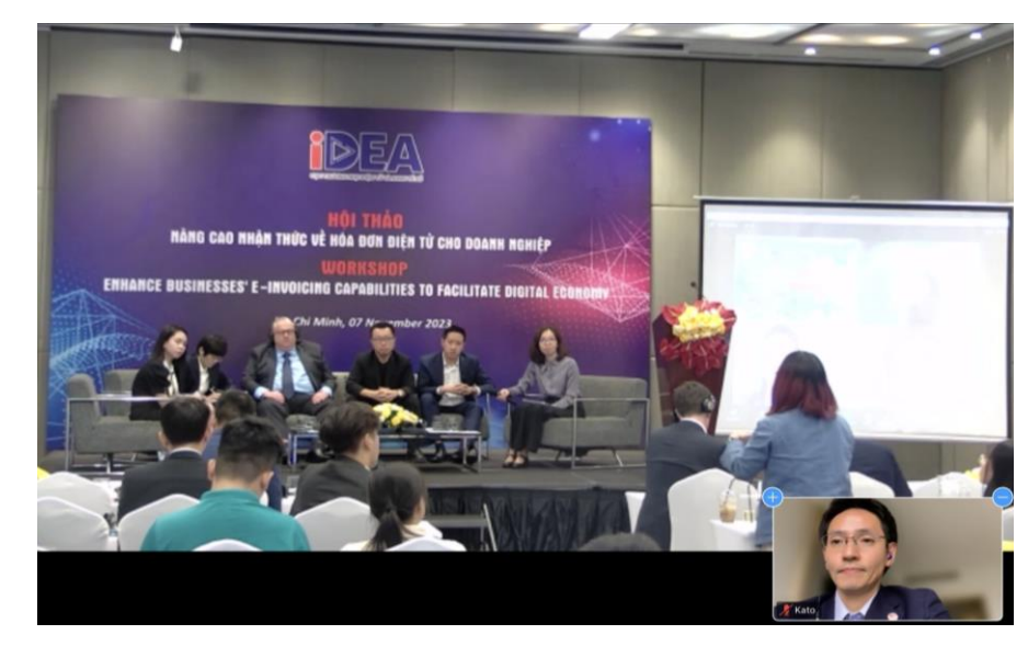
There were active exchanges